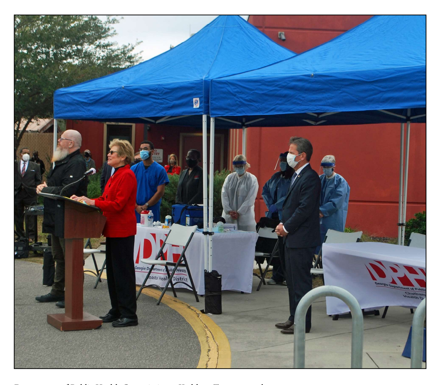
Department of Public Health Commissioner Kathleen Toomey speaks.