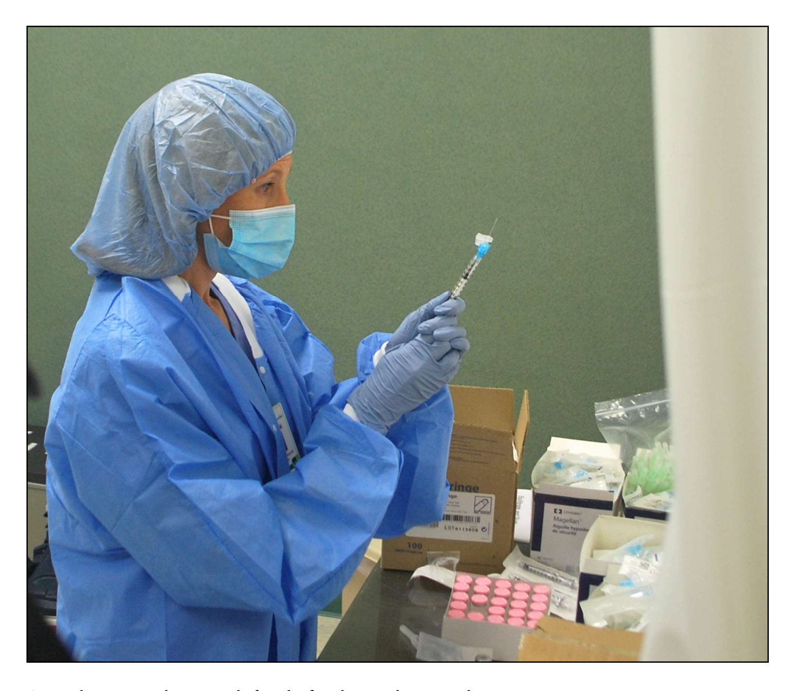
An employee mixes the vaccine before the first dose is administered.