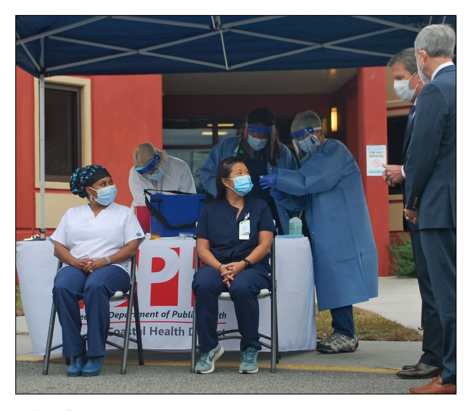
Employees talk to Gov. Kemp.