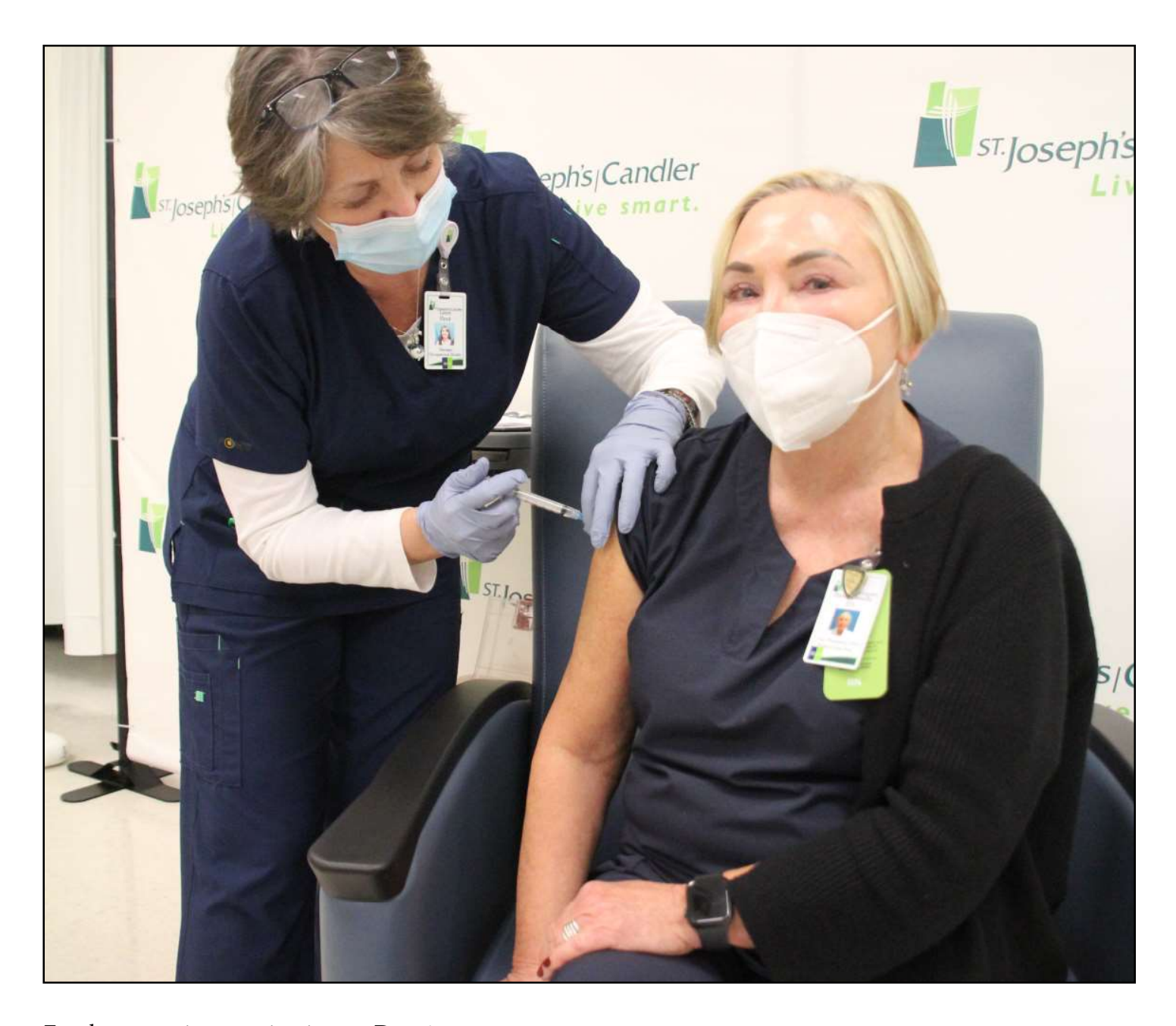
Employee receives vaccination on Dec. 15.